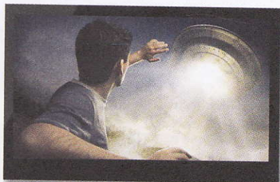
science fiction film